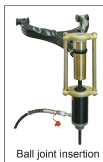
Ball joint insertion

Suitable for changing suspension ball joints on Mercedes Sprinter (904) models '95 onwards and VW LT (2D) models '96 onwards.